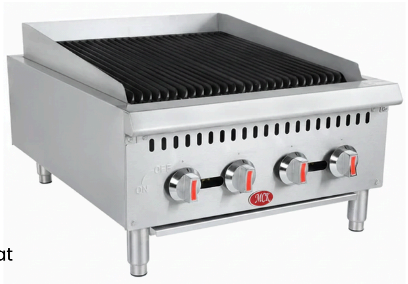
MCK-2000-ECB-24HD | HLRC600